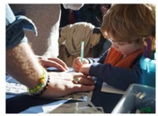
ArtLab for All Saturday, April 8 2:00-4:00 | ArtLab | Drop-in | Free and open to all!

Join us and learn how to make small keepsake baskets using cardboard and a variety of materials. Add small keepsakes into your weavings creating various designs and patterns using yarns and other fiber materials!